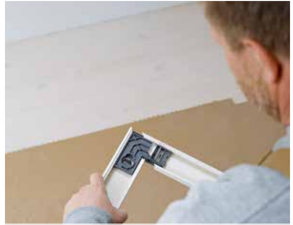
2. Assemble moulding.