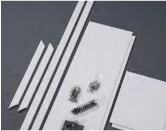
1. Prefabricated light shaft assembly kit.