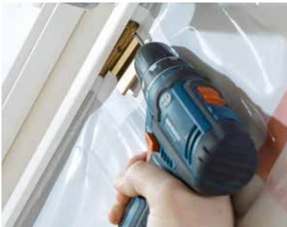
3. Install mounting clips to skylight drywall groove.