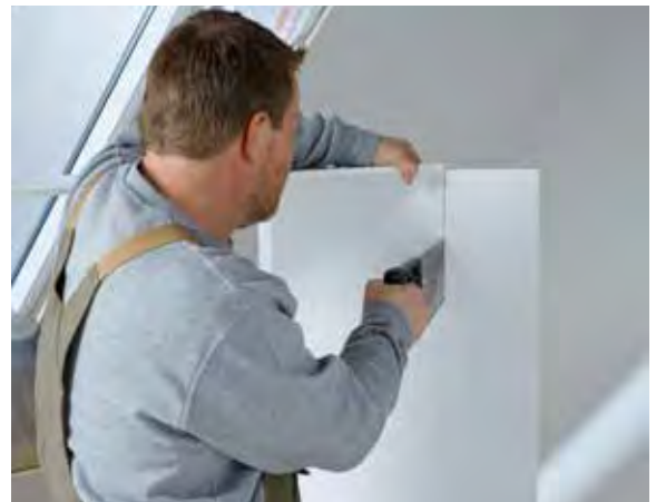
4. Measure and cut panels to proper depth and join to moulding.