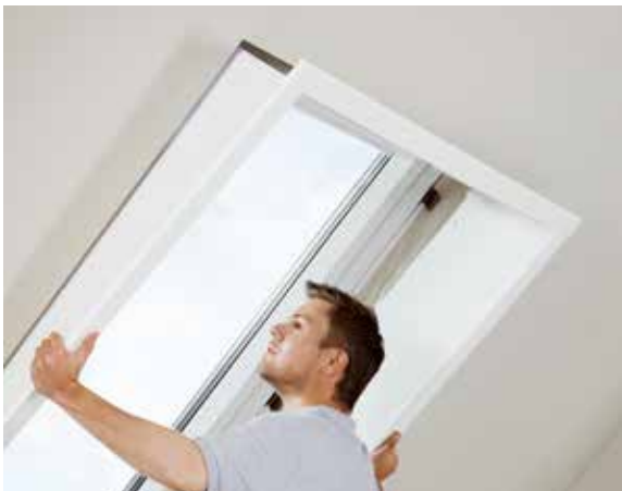
5. Align assembled light shaft to mounting clips and click to install.